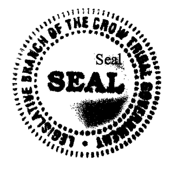
Secretary, Crow Tribal Legislature

October 2007 Special Session LR 07-06 DEFINITION OF (2/3'S) TWO THIRDS LEGISLATIVE VOTE ACTION Page 2 of 2